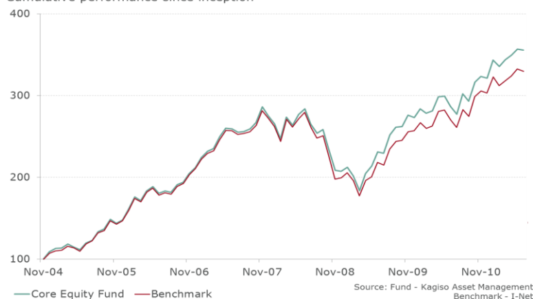
Cumulative performance since inception

* Information ratio = \frac{\text{outperformance}}{\text{tracking error}} # Maximum % increase/decline over any period